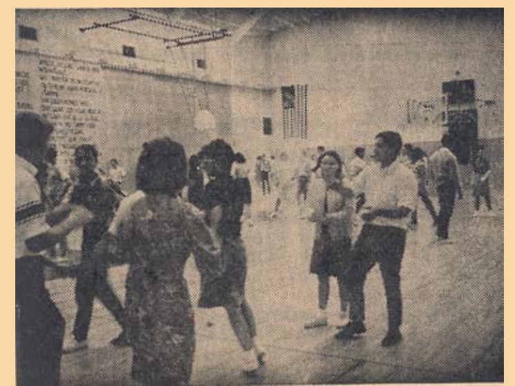
Swing your partner, promenade around the ring . . . "Square dancing isn't for squares."